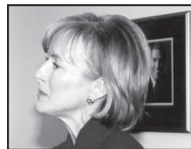
Judy Woodruff, PBS