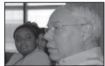
General Colin Powell